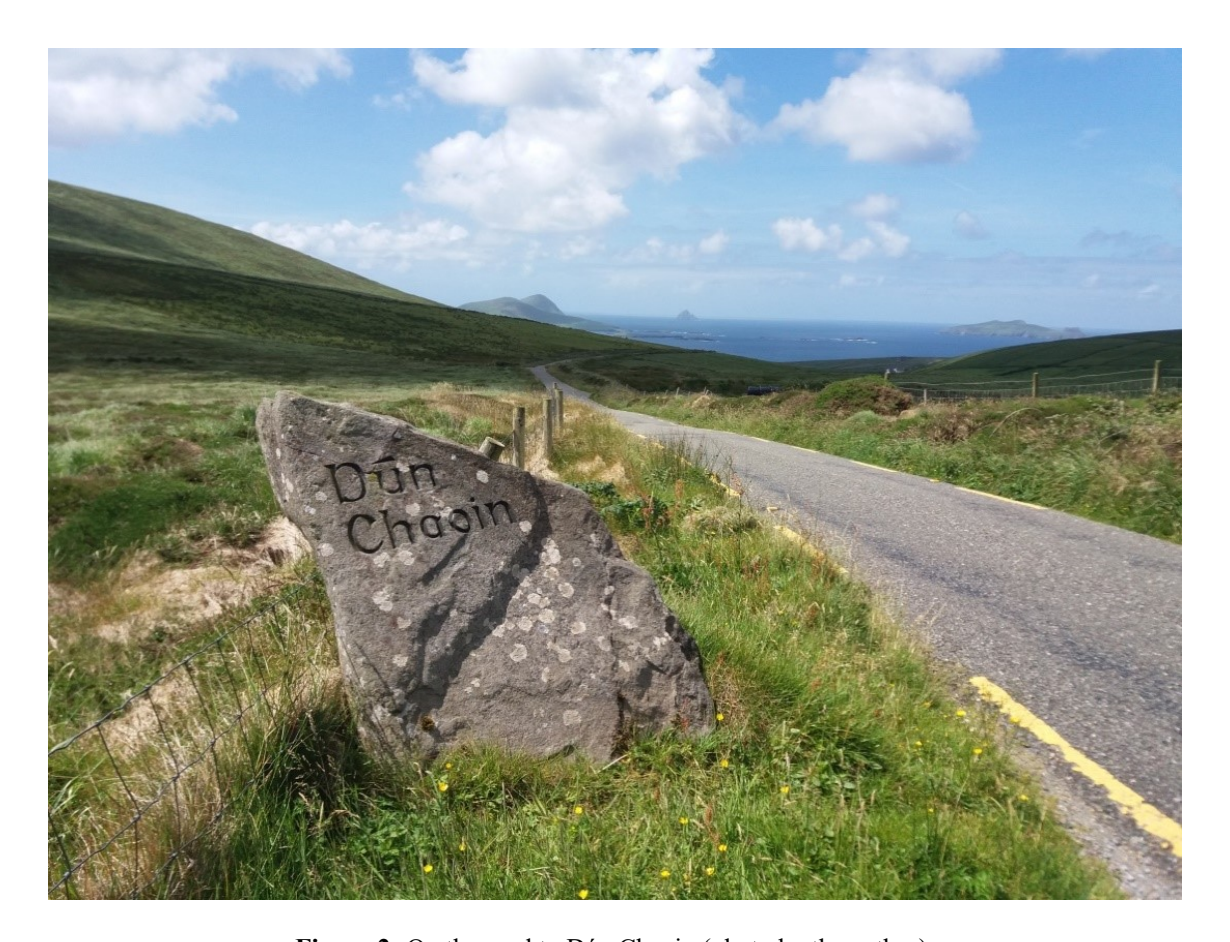
Figure 2: On the road to Dún Chaoin (photo by the author).