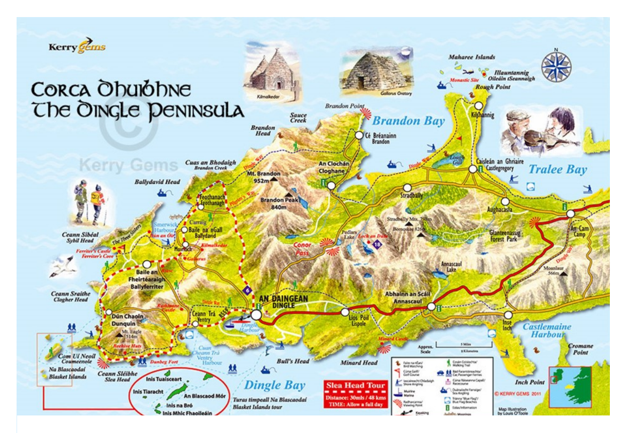
Figure 3 : A tourist map of the Corca Dhuibhne peninsula. The red line represents the main road connecting the town of Dingle with Tralee, the main county town (which is not on the map). The red-and-white hatched line indicates the Slea Head Drive, a panoramic circular route through the back west part of the peninsula, which is also the core Irish-speaking area of the Corca Dhuibhne Gaeltacht.

Source: <a href="http://www.angailearaibeag.com/irelandmap.html">http://www.angailearaibeag.com/irelandmap.html</a>, retrieved 18. 3. 2019.