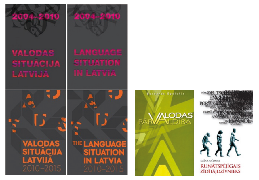
Fig. 3: Research on language situation and translations of scholarly literature by LLA

The results of this research are published to make them widely available. In addition, every year a book or a piece of research on a sociolinguistic or language policy subject is translated into Latvian to educate society, to popularise the latest ideas and practices in this field, and inform the public at large. To ensure the highest possible availability of information for everyone who is interested and involved in the implementation of language policy, major studies are published electronically on the LLA website (www.valoda.lv) in Latvian and English (Latvian version – http://www.valoda.lv/petijumi/sociolingvistika/, English version – http:// www.valoda.lv/en/research/study-of-the-linguistic-situation/).