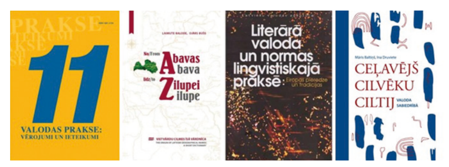
Fig. 4: Some scientific and popular-science publications of LLA

To ensure the development of Standard Latvian, attention is focused on the following: the development and publishing of scientific and popular publications; support for the development of various dictionaries; and the development of online resources for various linguistic issues (informative, educational materials etc.). Among these publications are an annual collection of popular scientific articles: "Language practice: observations and recommendations. No. 11" (2016); "From Abava to Zilupe . The origin of Latvian geographical names. A short dictionary" by L. Balode and O. Bušs (2015); "Standard language and its norms: language use and traditions in Europe" (2014); "Trade wind for the human tribe. Language in society" by M. Baltiņš and I. Druviete (2017).