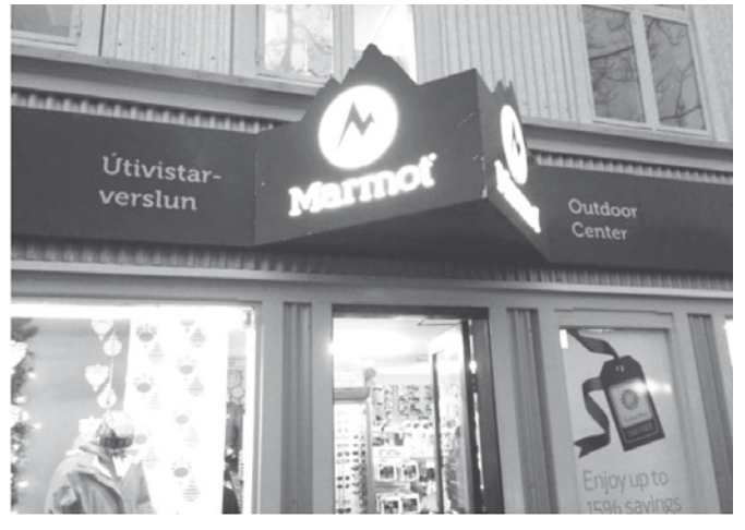
Fig. 3: A shop in downtown Reykjavik: advertising signs partly in English and partly in Icelandic