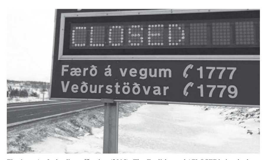
Fig. 1: An Icelandic traffic sign (2015). The English word 'CLOSED' signals that a road has been temporarily closed to all traffic

Among the effects of the 2011 legislation is that if Icelandic official bodies use English and not Icelandic in administration today (where this is not explicitly sanctioned by other legislation), one can now refer to Articles 1 and 8 of the language law if one wishes to complain.