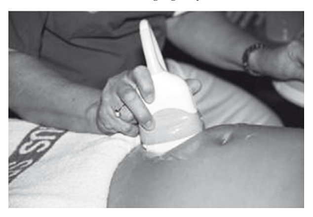
Fig. 4: Ultrasonography at a pregnancy ward

This case is interesting in that it may be interpreted as a counterexample to the dogmatic stance in traditional Icelandic language policy discourses, mentioned above, that native word formation is superior to borrowings in terms of semantic transparency. The sónar example suggests that using the purist lexical item, ómskoðun , may be counterproductive if plain language is the goal.